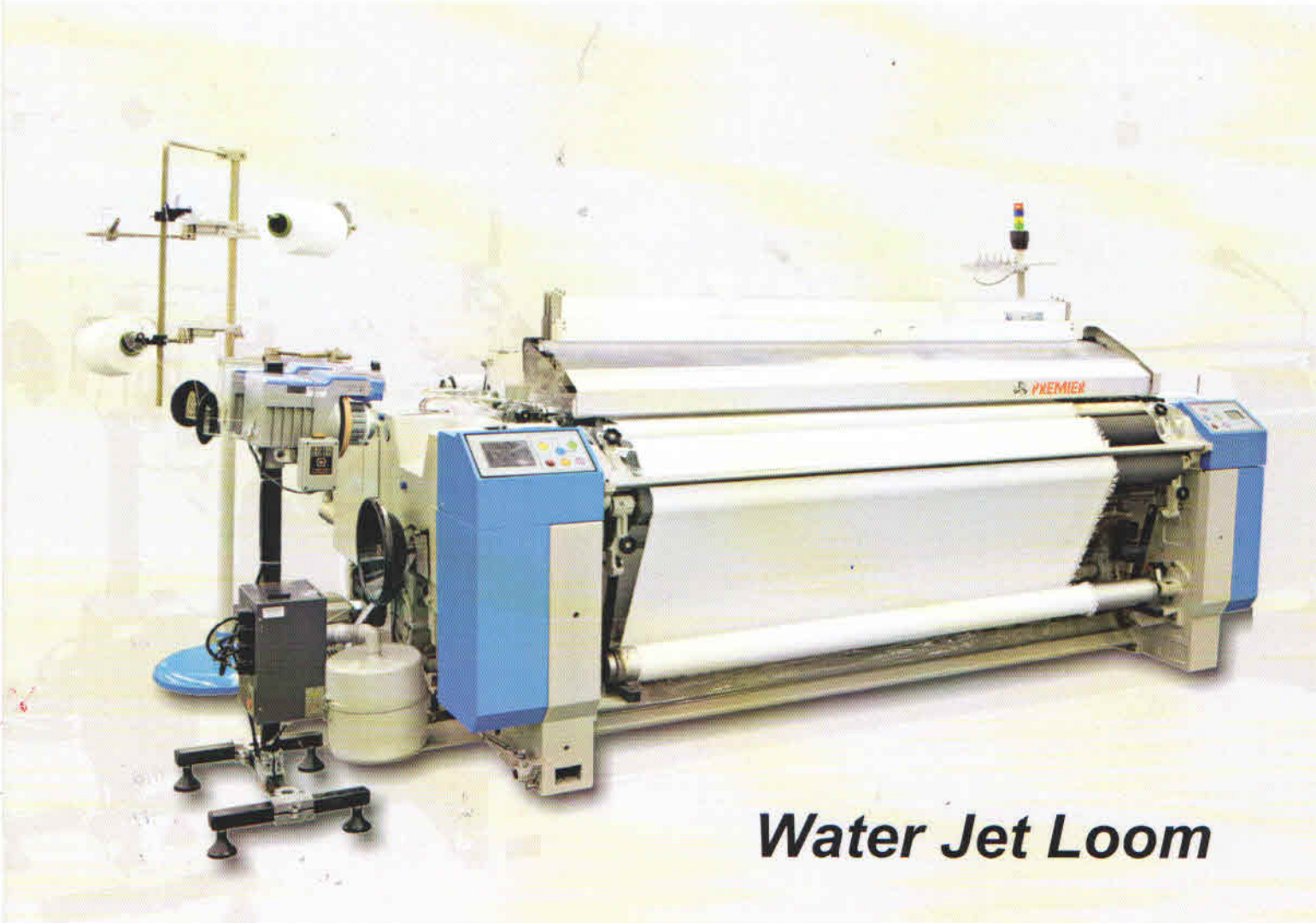
Water Jet Loom